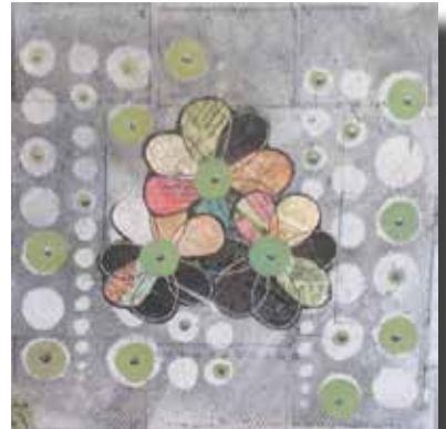
- Bubbles 'n' Blooms by Chris Treu